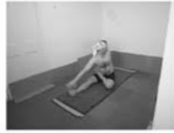
ardha-badha padmasana variation