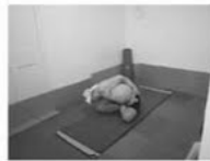
dakshina yoga mudra