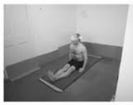
Ardha badha padmasana Vinyasas