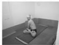
twist to right side in lotus