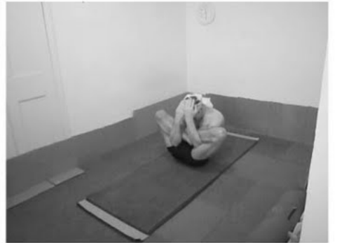
Purna garbha pindasana