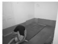
akunchita urdhwa padmasana variations