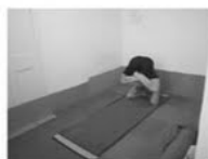
Viparita yog mudra