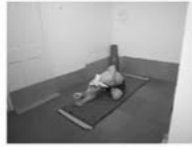
Ardha badha padmasana pashimatanasana