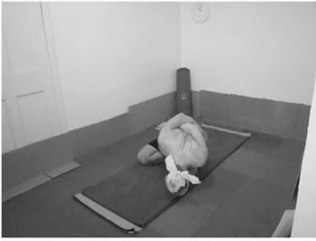
vama yoga mudra