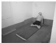
padma bhujangasana / ious cobra pose