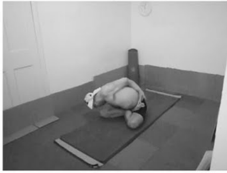
dakshina yoga mudra