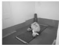
vama yoga mudra