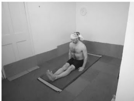
Ardha badha padmasana Vinyasas