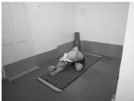
Ardha badha padmasana pashimatanasana