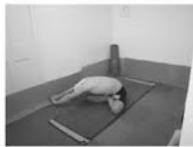
dakshina-parsva-laghu yoga mudra