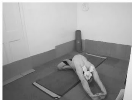
vama-parsva-laghu yoga mudra