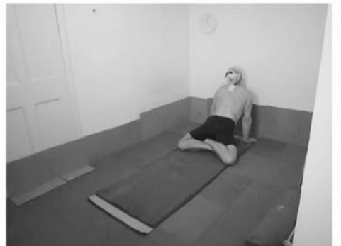
padma bhujangasana / lous cobra pose