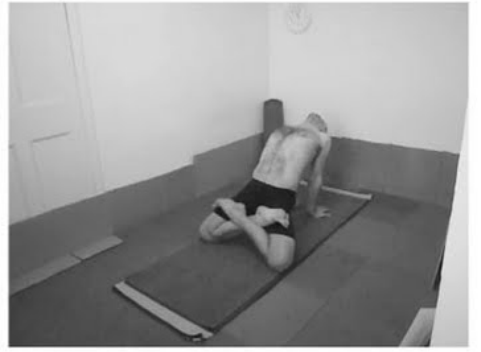
Urdhwa mukha padmasana