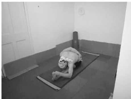
Ardha badha padmasana pashimatanasana