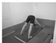
return sequence downward facing dog