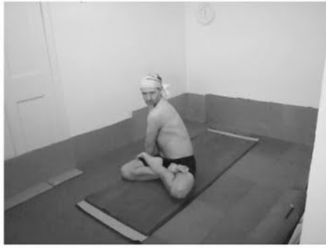
twist to right side in lotus