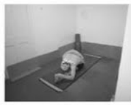
Ardha badha padmasana pashimatanasana