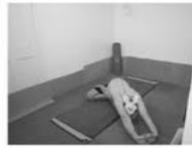
vama-parsva-laghu yoga mudra