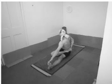
ardha-badha padmasana variation