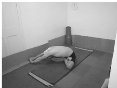
dakshina-parsva-laghu yoga mudra