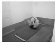
Purna garbha pindasana