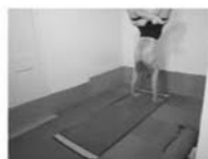
lotus in handstand