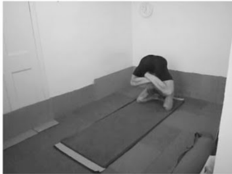
Viparita yog mudra