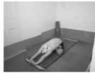
Laghu yoga mudra