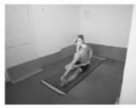
ardha-badha padmasana variation